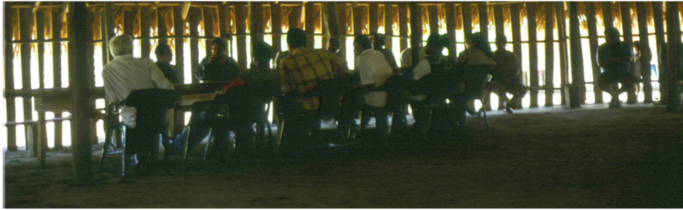
Village leaders receive the Minister of the Social Affairs and his entourage in Tëpu, Sipaliwini district