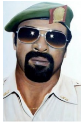
The iconic image of Desi Bouterse, now democratically elected President of Suriname, from the 1980s when he first came to power through a coup d'état