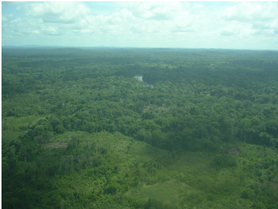
Swidden gardens and secondary forest near Kwamalasumutu, Sipaliwini