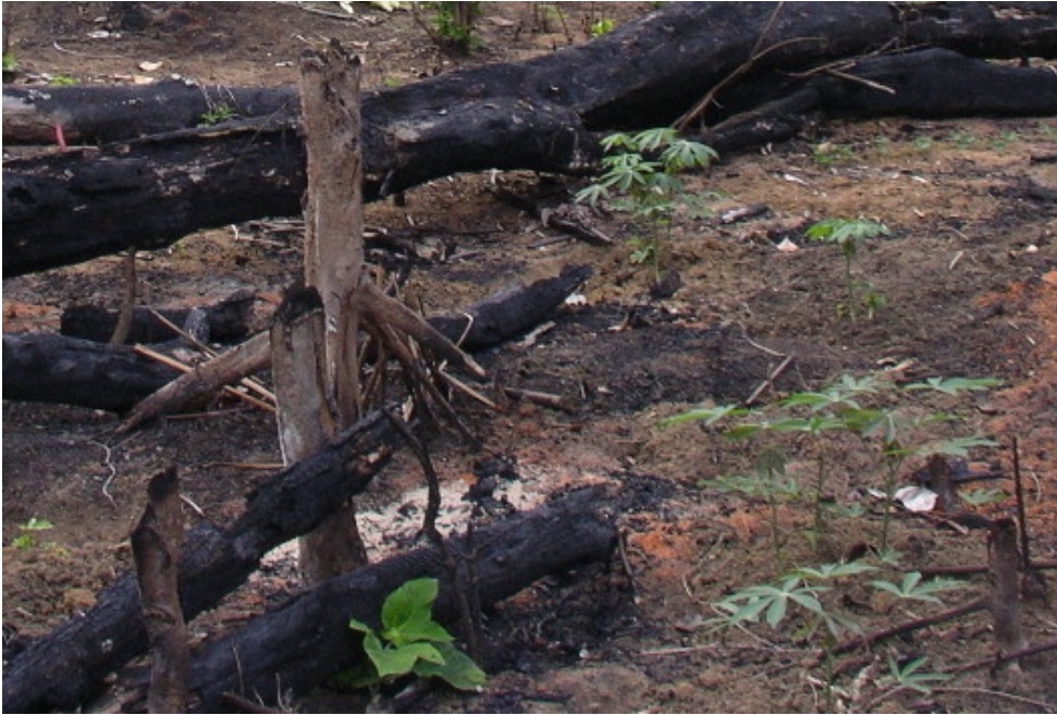
Manioc shoots in a newly cleared and planted garden

‘5. [t]he State shall delimit, demarcate, and grant collective title over the territory of the members of the Saramaka people, in accordance with their customary laws, and through previous, effective[,] and fully informed consultations with the Saramaka people, without prejudice to other tribal and indigenous communities.’